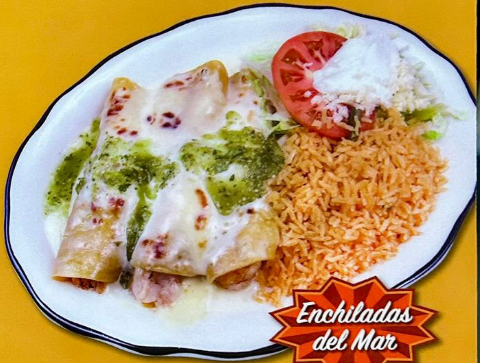
Enchiladas del Mar