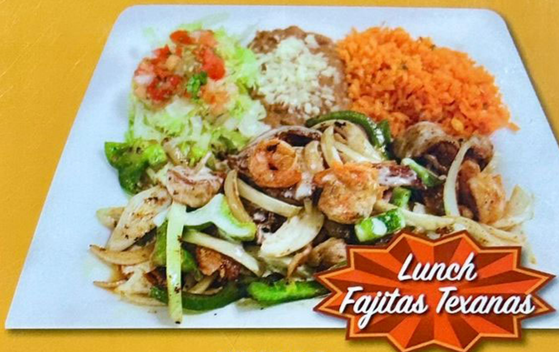
Lunch Fajitas Texasanas

Hard or soft chimichangas with shredded beef or chicken, served with rice and beans 10.75